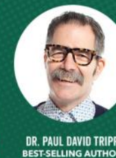
DR. PAUL DAVID TRIPP BEST-SELLING AUTHOR